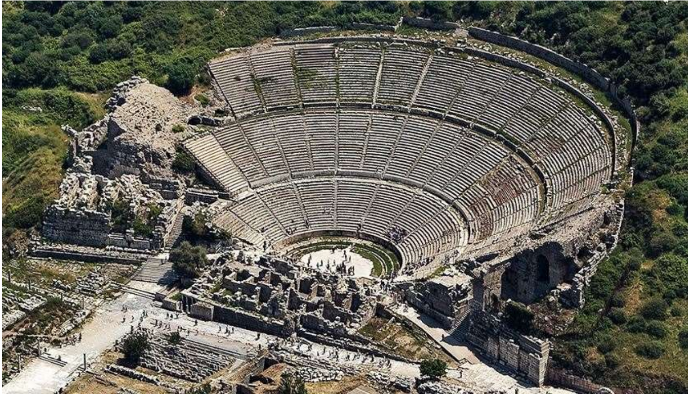
Great Theater of Ephesus