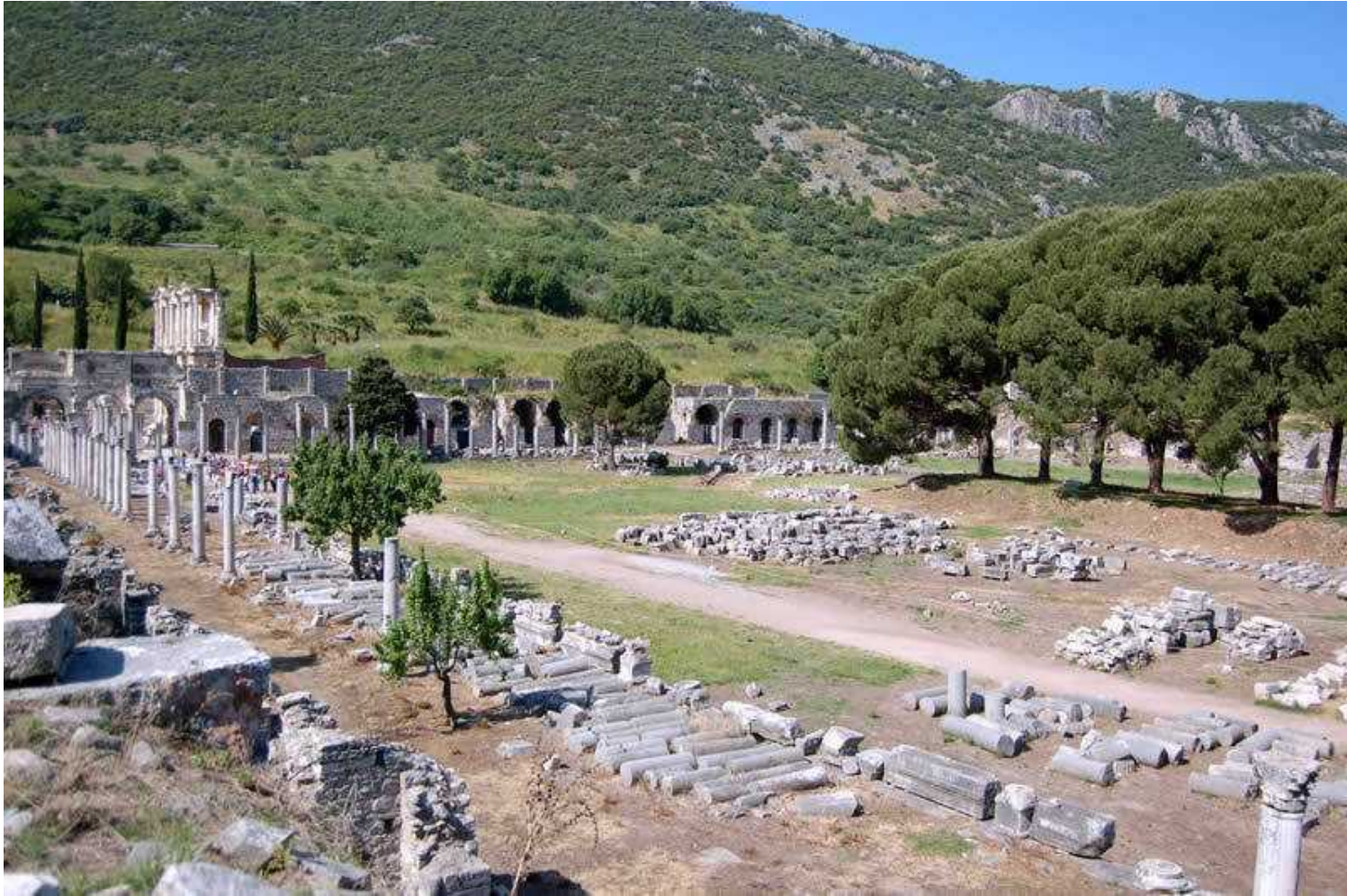
The Market place at Ephesus